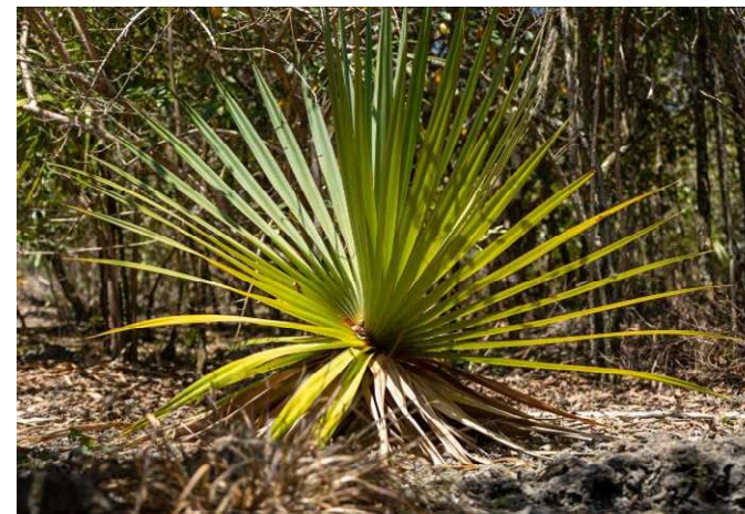
Critically Endangered Pandanus vandermeeschii growing in the wild on Ile aux Aigrettes.

The MWF holds the co-chairship of the IUCN (International Union for the Conservation of Nature) Mascarene Islands Plant Specialist Group, with an overview on Mauritius and Rodrigues from 2021-2024. The group brings specialists together and is working on completing the Red List of Mauritian plants. In 2019, the Specialist Group was awarded the IUCN Species Survival Commission's Chair's Citation of Excellence for its work.