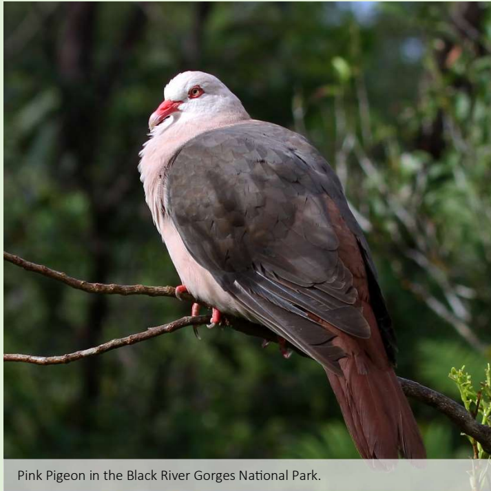
Pink Pigeon in the Black River Gorges National Park.