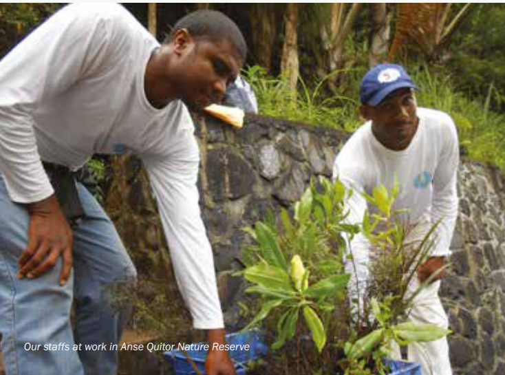
Our staffs at work in Anse Quiitor Nature Reserve