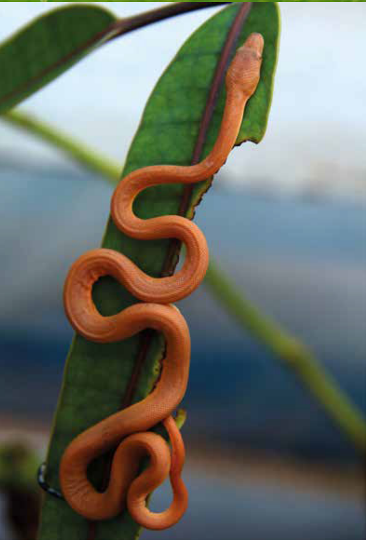
Round Island Boa

If you want to know more about our projects or support us, please get in touch: