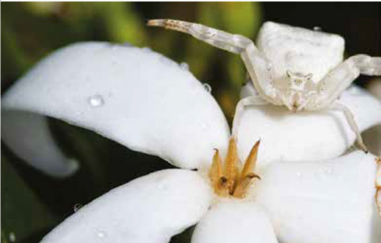
Café Marron (Rodrigues)