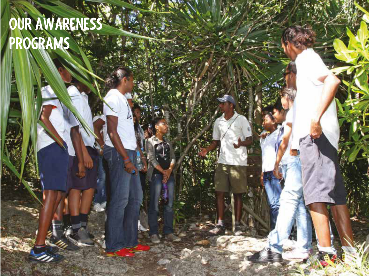
Students visiting Ile aux Aigrettes (Learning with Nature Education Programme)