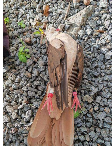
20/11/2023 – Adult Pink Pigeon killed by vehicle collision.