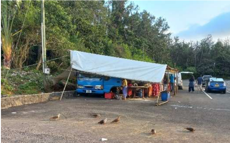
15/10/2023: Pink Pigeons attracted to the floor of the Petrin parking area by food scraps.

a feeding station for birds and an important hub for the mixing of birds from different areas within the Black River Gorges National Park. This helps maintain genetic diversity. It is also important as it is a place where the public can see the Pink Pigeon easily. However, this is also the problem. The public feed the birds, there are food stalls in the car park, and this attracts birds to the road area where passing cars kill them.