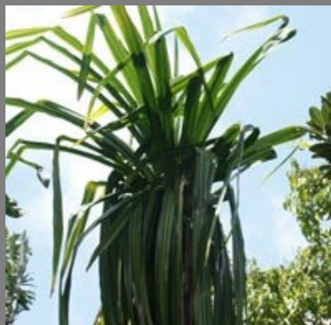
Pandanus iceryi

The government project to build a new highway linking the airport to the hotels in the east is causing concern in Mauritius. The highway is planned to go through the native forest of Ferney. The forest is exceptionally rich, containing over 108 plant species including endangered species such as Olax psittacorum , Poupartia borbonica , Sideroxylon grandiflorum , Gouinia tillifolia . Three species also believed to be extinct were found on the proposed route: Eugenia bojeri (now known from 3 individuals) and two species of Vacoas ( Pandanus macrostigma , and Pandanus iceryi )