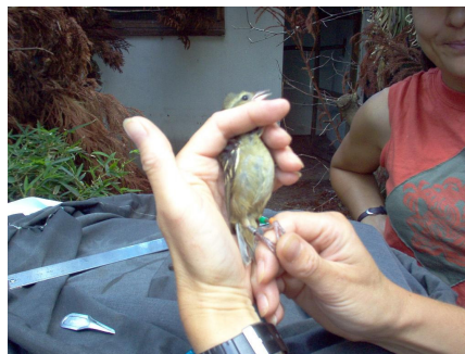
Mauritius Fody being rung before release